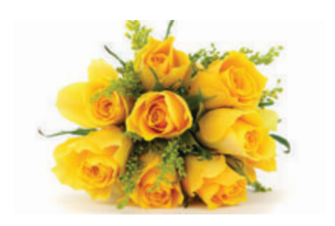
With fond memories of our Dearest Chairman You will always inspire and guide us.